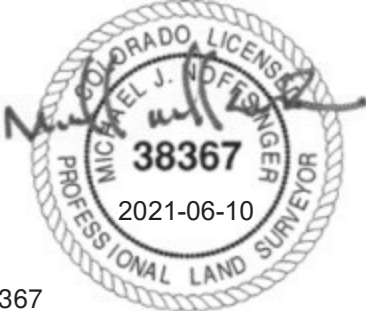
ILLUSTRATION ATTACHED AND MADE A PART HEREOF.